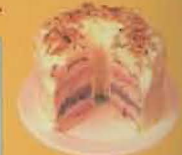
Angel Food Ice-Cream Cake, page 197