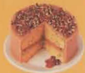
Banana Cake with Caramel Frosting, page 72