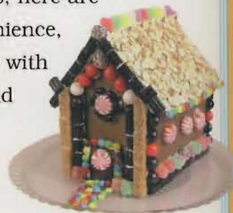
Gingerbread House, page 218