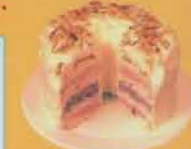
Angel Food Ice-Cream Cake, page 197