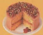
Banana Cake with Caramel Frosting, page 72